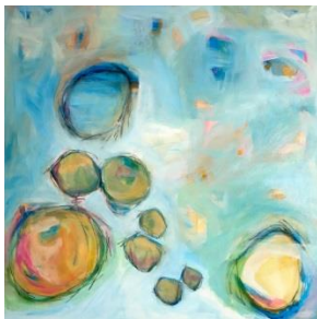
Emily Williams-Wheeler Painter

$1,200 toward office space in which to focus on creating a full-length poetry collection for publication.